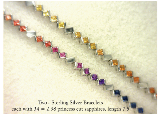
Two - Sterling Silver Bracelets each with 34 = 2.98 princess cut sapphires, length 7.5